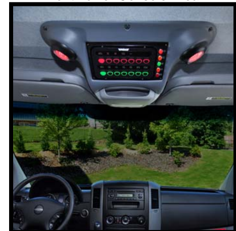
Optional Overhead Console Area