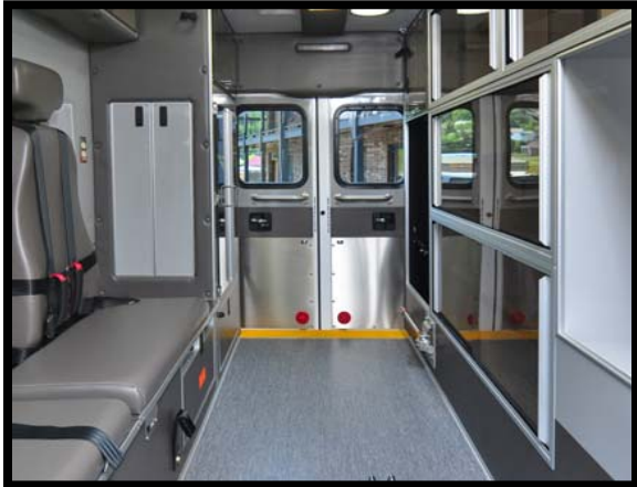
Inside View From Front