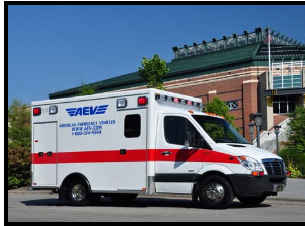
Front 3/4 View