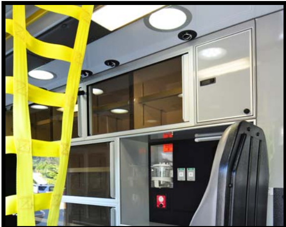
Streetside Upper Cabinet Area