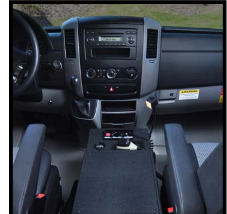
Front Lower Console Area