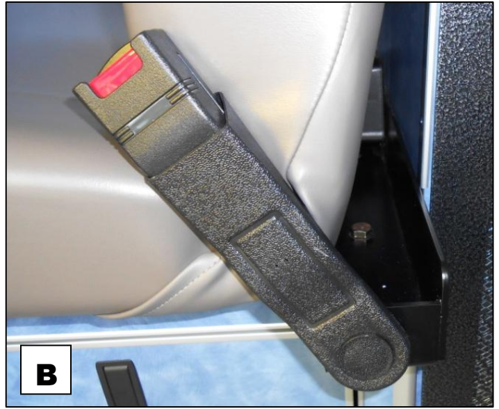
CABLE TYPE BELT