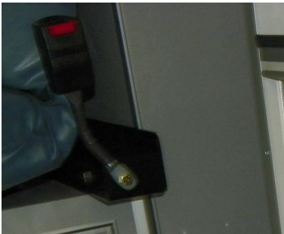
Nut and Bolt Assembly