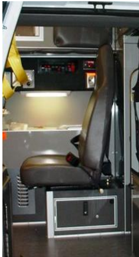
Threaded Nut Assembly